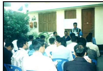
Training for Interviewer

80.8% respondents said that birth registration is done here in the UP, 14.3% said it is partially done and only 4.9% said it is not done.