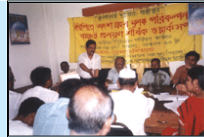
A workshop on participatory planning and budgeting of Union Parishad at Baria in Gazipur

In this workshop the necessity of participatory planning, usefulness, procedure of budgeting and planning, Participatory approaches were discussed. Finally They made a action plan of their UP.