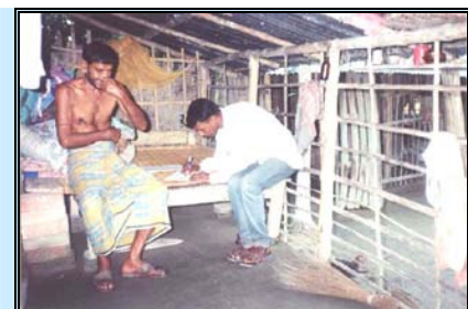
Data Collection for Baseline Survey

On the question about the satisfaction level of people about the activities and services rendered by female UP members, only 20.2% respondents said that they were satisfied, while 44.5% respondents didn't know any thing about her.