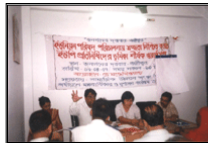
A workshop on the Role of Union Parishad representatives of Baria in Gazipur

One of the participant told that, we must ensure transparency in not only the union parishad level but also at national level to ensure similar picture in all aspect of the country.